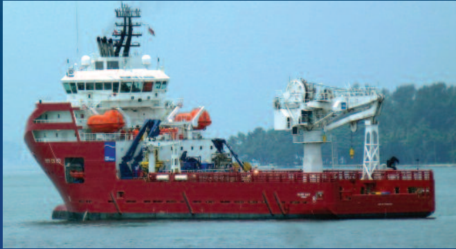
Offshore industry vessel support, such as the Skandi Hawk, designed for offshore construction, ROV, and seafloor survey work in blue-water environments.

the mining region and transport them to the surface for testing. Full drilling operations are then conducted to determine the volume of deposits throughout the area.